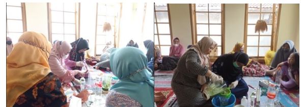
Figure 4. Making hand sanitizer independently and team works by partners under the guidance of handbook created by employee of community empowerment

As a form of monitoring and evaluation, the community empowerment team has given questionnaires twice to all partners involved in this activity with a total of 18 participants. The first questionnaire was in the form of pretest questions given before the counseling and training was carried out, and the average score was 59.7. Furthermore, the second questionnaire was given as post-test questions given after the partners completed this activity training with an average score of 77.2. Based on the average value, there was an increase in knowledge about the processing celery as hand sanitizer. The measurement of initial and final knowledge is carried out as a step for monitoring and evaluating partner knowledge which is presented in the following graph (Figure 5).