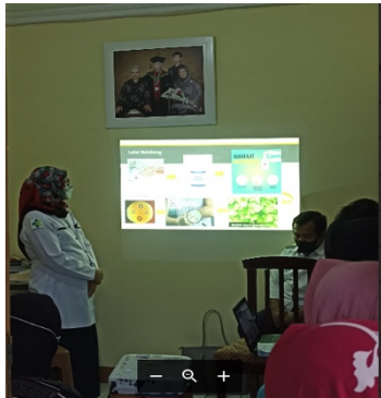
Figure 1. Counseling was done by the team of community empowerment about of introduction of celery utilization as hand sanitizer