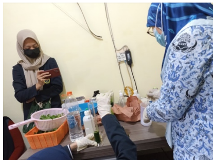
Figure 2. Demonstration of processing celery as hand sanitizer was done by the team of community empowerment

After receiving learning materials and demonstration from team (figure 1 and 2), each participants who are represented by the Chair of RW 05 Babakan Loa Street, North Cimahi, received handbooks (figure 3) which containing guidelines for processing celery as hand sanitizer. In addition, participant also received materials and equipment needed for processing celery as hand sanitizer so that can do experience independently or in team work (figure 4).